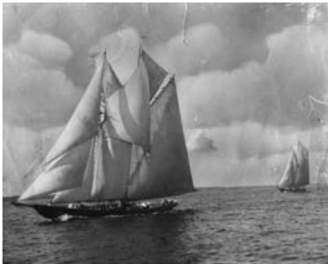
Schooner Columbia 1926