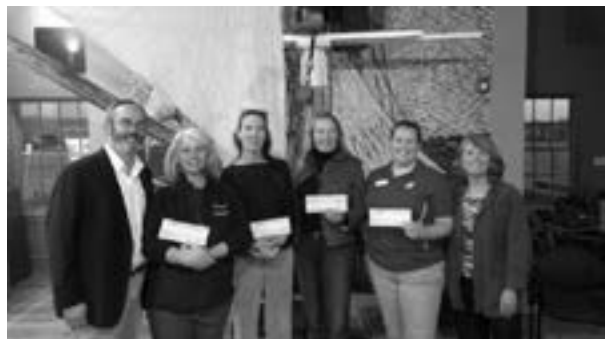
2013 Youth on Water Grant Recipients